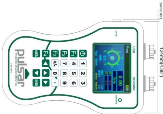
Flow Pulse HandHeld Controller Front Drawing