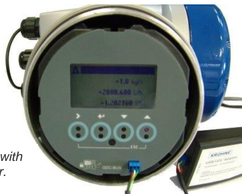
Direct connection with USB-GDC adaptor.