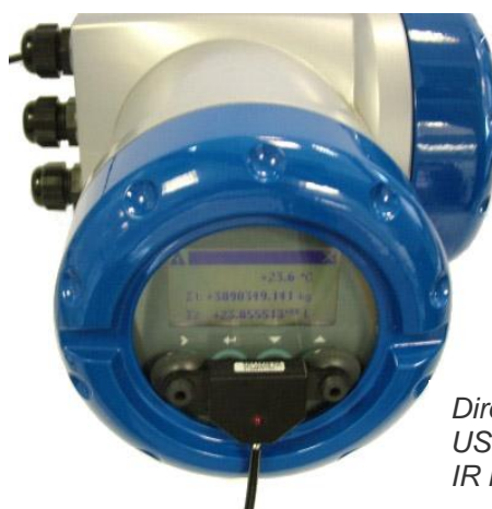
Direct connection with USB-GDC adaptor & IR interface.